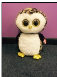
Ollie the Academy Owl